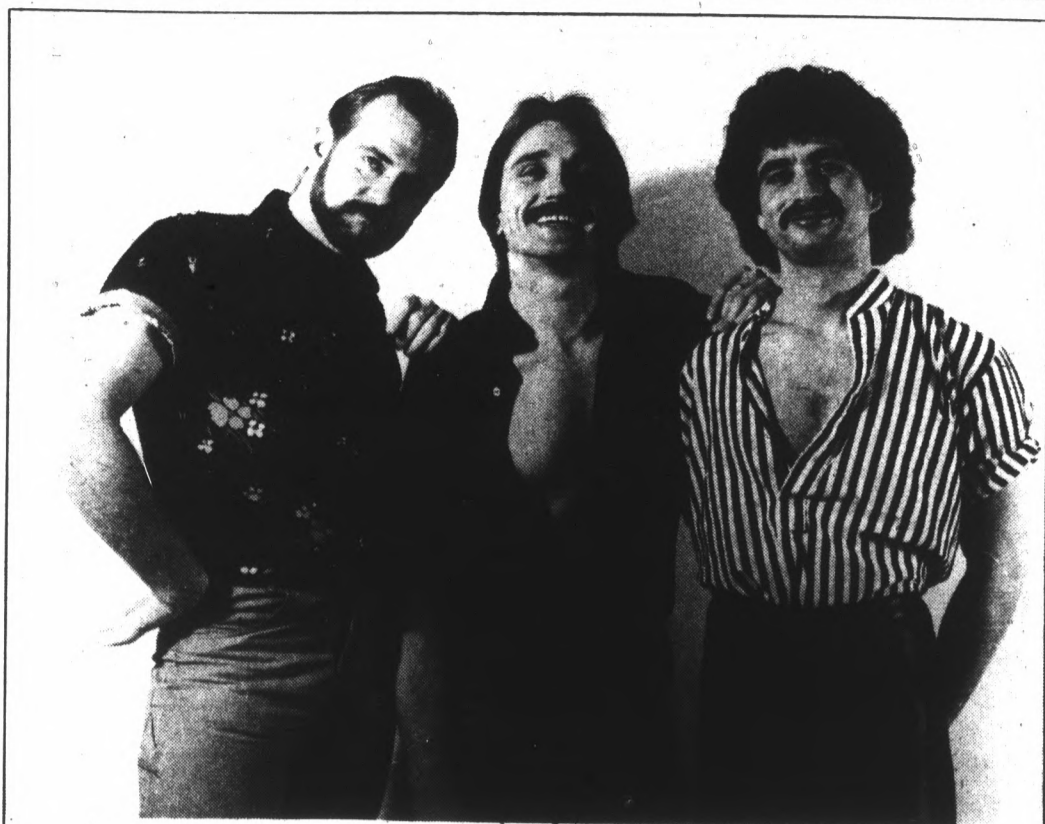
The songbirds are back! Buena Vista returns New Year's Eve, at Rainbow Cattle Company in SF. Check out the Coming Up! calendar for details on this and other decade-starters.