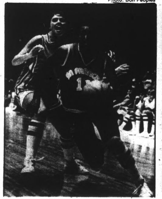
On The Move! . . . That would be our own SF Pioneers, commanding the court at several home games this month. Check calendar listings for January 6, 9, 21 & 22.