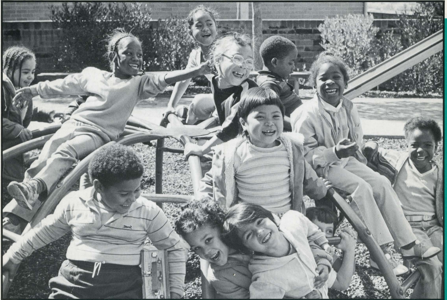
Students at George Washington Carver Elementary School take a recess break.