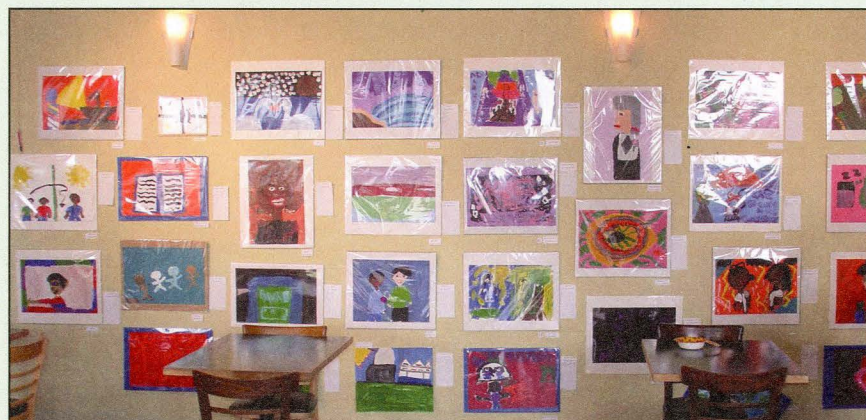
Exhibit of artwork from the “Dialogues in Culture” class