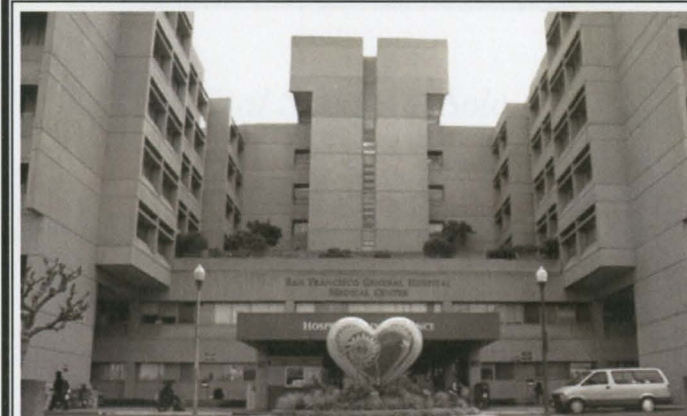
San Francisco General Hospital & Medical Center President of Governing Board of SFMCOIP, Inc. - 1973