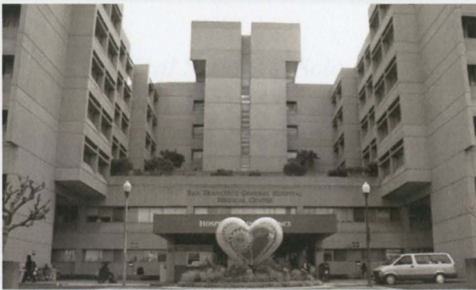
San Francisco General Hospital & Medical Center President of Governing Board of SFMCOIP, Inc. - 1973