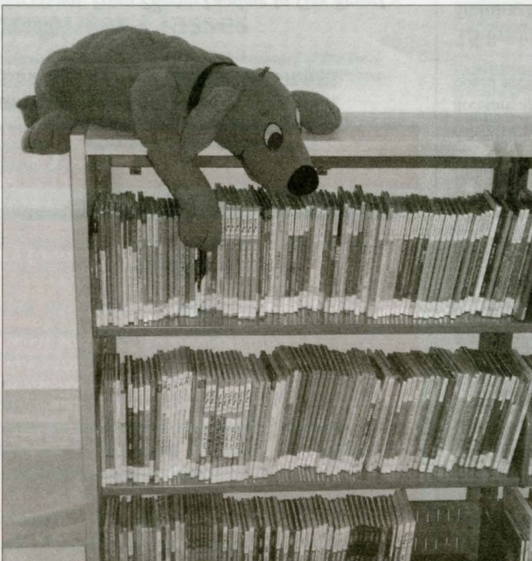
Children's Room at Excelsior Branch Library.

"Thank you" to everyone who helped make this new and improved branch possible, including the Bureau of Architecture's Library Design Studio, the Department of Public Works and the City & County of San Francisco. ☺