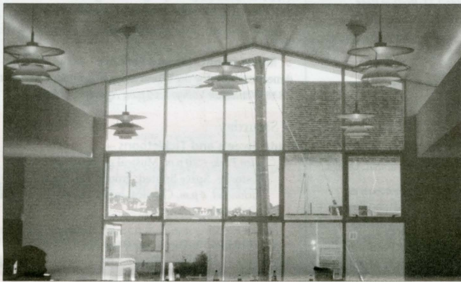
Renovated interior of Excelsior Branch Library.