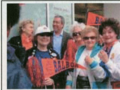
Bal Girls at the Excelsior Library Opening

Friends & Advocates of Crocker-Amazon & The Excelsior