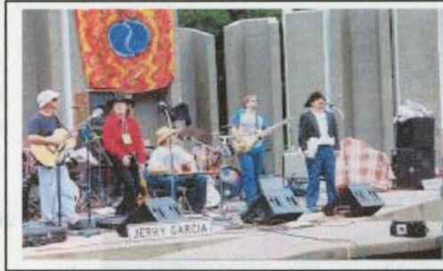
Jerry Garcia Amphitheatre Officially Named