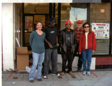
to help and decorate the strip!