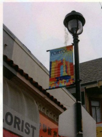
One of the many banners added to enhance the streetscape

Part of the program included the bright and colorful banners that you see along the strip to denote the pride that we have in our district. The PNSC wants to thank everyone who helped us out for their support in making the streetscape much more pleasant. The additional money raised will be for other beautification efforts along San Bruno Avenue.