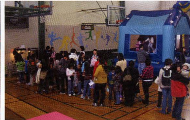
Replanting Lilies Event in February 2010