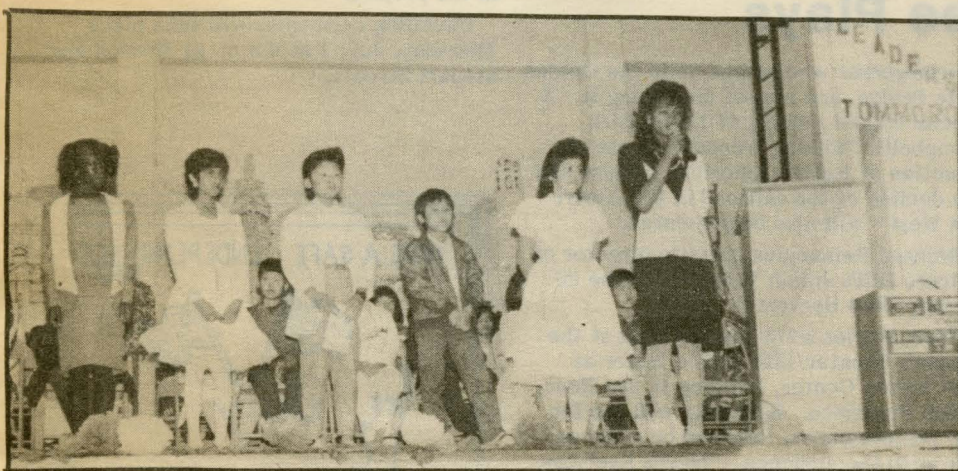
Students at the elementary schools' graduation ceremonies greeted their audiences in many languages. The students in photo are from Starr King School.