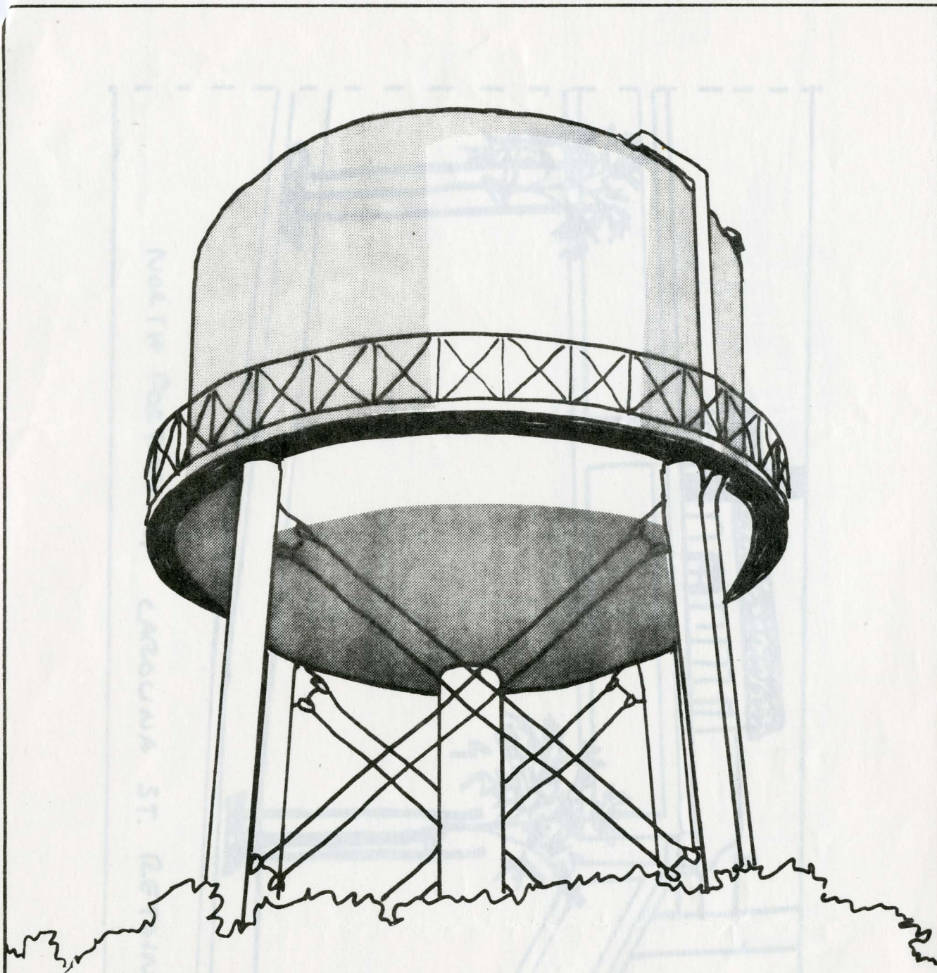
WATER TOWER - POTRERO HILL WISCONSIN & 22 ND STREETS