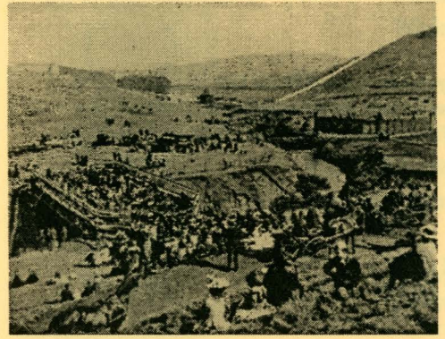
Glen Park District 1898