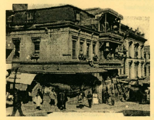
Chinatown District 1889