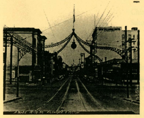
Fillmore and Fulton Streets 1936