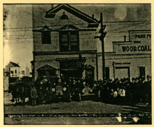
Sunset District 1915